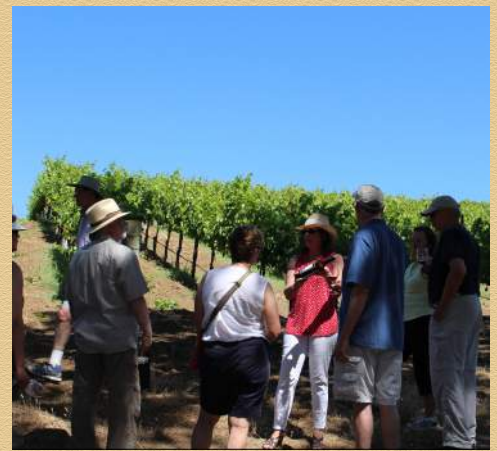
Learn about our wines, and history!